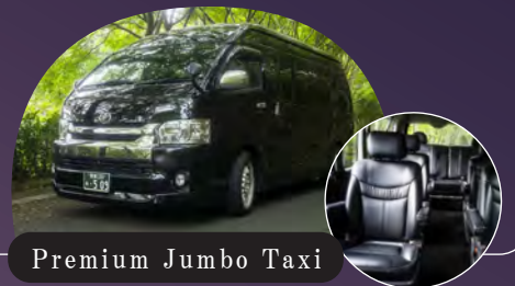
Premium Jumbo Taxi

Uchiko town has two famous cherry blossom spots which are "Aino-no-hana" and "Okubi pond". "Aino-no-hana" is a large weeping cherry. When you step into the drooping branches, you will feel like you are in a fairy tale. On the other hand, the cherry trees at "Okubi pond" are Somei-Yoshino. The cherry blossoms reflect in the pond, creating a beautiful postcard-like scenery. You get to visit these two sights by a premium jumbo taxi. Dinner is served before the night Sakura tour at "Kotetsu". You will enjoy a comparison of 4 types of local sake from Uchiko and a Japanese course meal using seasonal fish. Enjoy a beautiful spring night in Uchiko town.